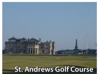
St. Andrews Golf Course