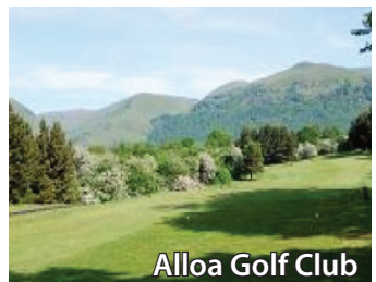
Alloa Golf Club